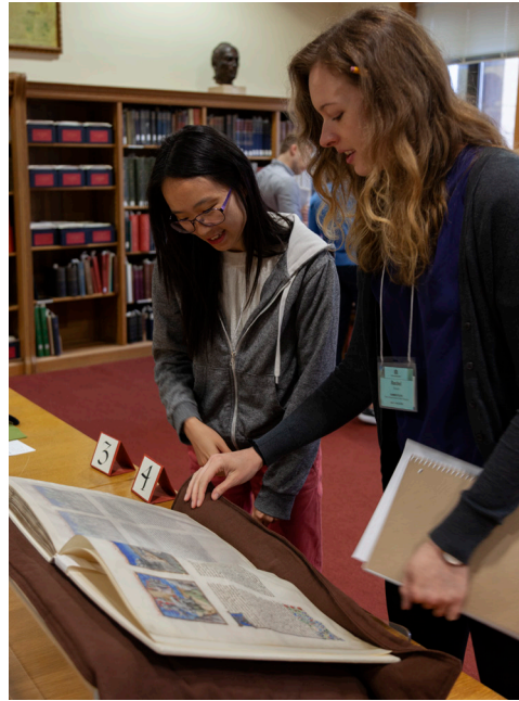
Participants in the French paleography summer institute discuss Le miroir de humaine saluation ( Mirror of Human Salvation ) 1455. Parchment with ink and gold leaf. VAULT folio* Case MS 40

This two-week summer institute will examine French manuscripts and archival materials from the thirteenth to the seventeenth centuries. Participants will explore the history of handwriting in France, receive intensive training in paleographic transcription, and become familiar with the development of handwriting as well as further aspects of written communication in the late medieval and early modern period.