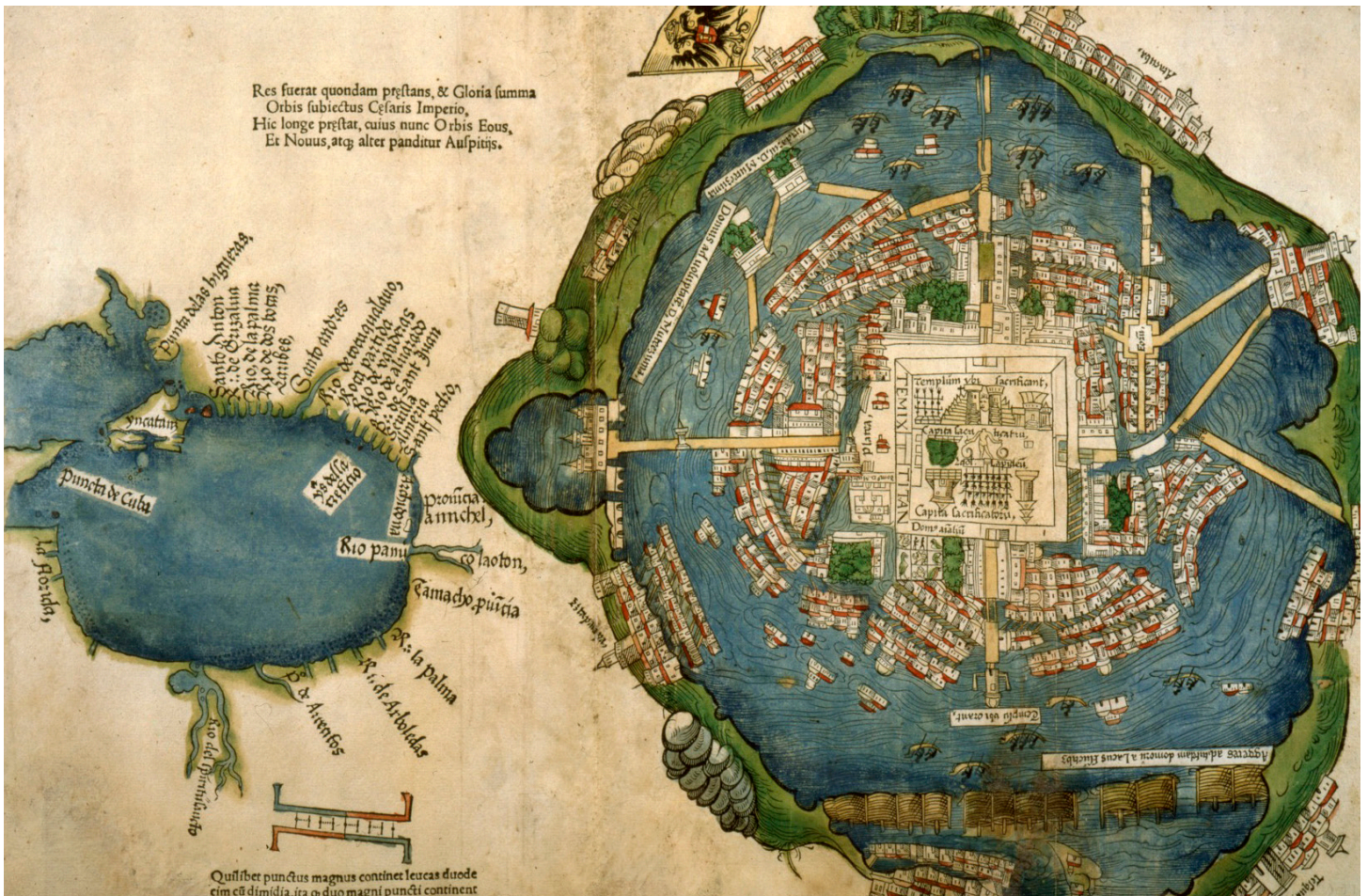
Nuremberg map of Mexico City (Cortés map), 1524, hand colored woodcut (Newberry Library, Ayer 655.51 .C8 1524b)