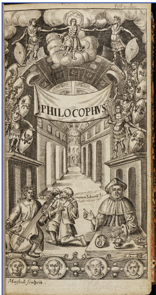
John Bulwer (1606-1656), author, Philocophus, or, The deafe and dumbe mans friend: exhibiting the philosophicall verity of that subtile art, which may inable one with an observant eie, to beare what any man speaks by the moving of his lips , 1648, Case HV2377 .J15 1648

This seminar aims to assist graduate students in the early phase of dissertation writing who have an interest in disability studies and/or crip theory. No previous courses in disability studies or crip theory are required. The seminar welcomes dissertators who want to learn and write about intersectional approaches to disability and early modern and eighteenth-century embodiment more broadly – including projects that assess how disability intersects with race, Indigeneity, class, gender, sexuality, and so forth.